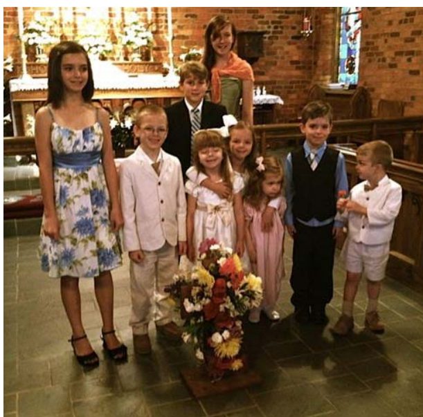
Flowering of the Cross